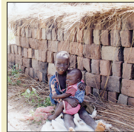
A child baby-sitting! Spousal trust can stop such crude treatment of children.

If you have sold a goat or cassava, let him know and discuss what you should do with the money. It is bad when a woman gets money and refuses to contribute to school fees or books for her children. Some can even eat food in darkness and fail to buy paraffin because the husband has no